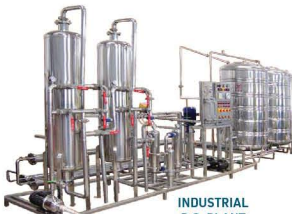
INDUSTRIAL R.O. PLANT