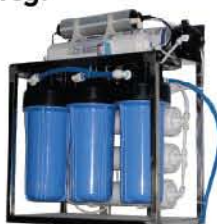
COMMERCIAL R.O. PLANT