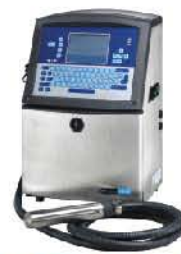
Batch Coding Machine