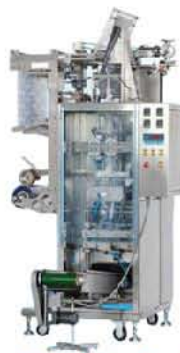
Pouch Packing Machine