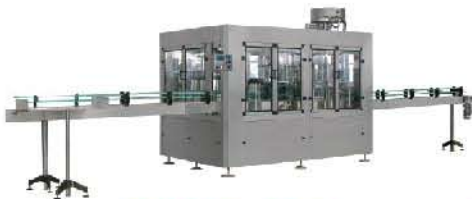
Bottle Filling Machine